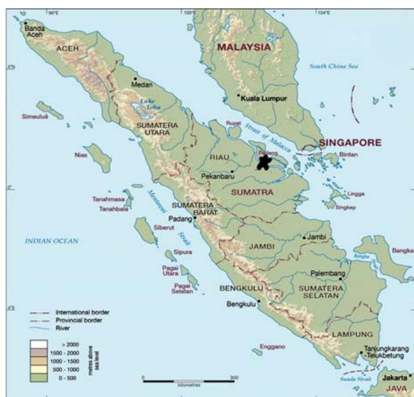
Fig. 12. Distribution map. Рис. 12. Карта распространения.

DISTRIBUTION. Indonesia: Sumatra (Fig. 12).