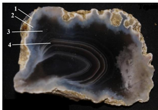
Figure 1. Concentrically zonal agate of Tersyuk district: 1 – cristobalite and quartz ( K_{ci} = 1,8 ), 2 – chalcedony ( K_{ci} = 1,2 ), 3 – chalcedony ( K_{ci} = 1,5 ), 4 – chalcedony ( K_{ci} = 2,9 )

Layer-by-layer X-ray diffraction study of minerals which make up separate layers in agates and onyxes allowed proving three minerals presence: chalcedony, quartz and (less often) cristobalite. The latter was found in Tersyuk agates (figure 1).