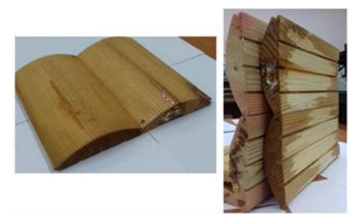
Fig. 2. "Blockhouse" samples

A wood building material, in addition to the available flat pine, aspen and larch samples [14–15], was used to imitate a pine bar ("Blockhouse") for evaluating the effect of the geometry of wood samples on ignition, as well as the effect of flame retardants on fire hazard characteristics. The size of the samples in the experiment was ( L \times W \times H ): 0.25 \times 0.02 \times 0.11 m. Fig. 2 shows a photograph of the building material sample used for imitating a bar.