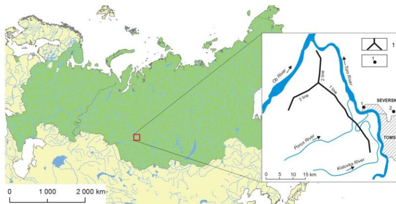
Figure 1. Layout of Tomsk and Seversk water intake facilities: 1 – lines of water intake production wells in Tomsk; 2 – water intake facilities in Seversk.

Operating regulations for analyzing and predicting hydrogeological condition changes within the areas of water intake facilities are stipulated by the monitoring system for groundwater level and quality. Analytical work was performed in accredited laboratories of OJSC Seversk Vodokanal and OJSC Tomskgeomonitring.