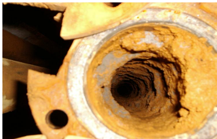
Figure 2. Precipitate in an ascending pipe in well No. 14.

Two morphological types of mineral neocrystallization are formed on the equipment of water intake facilities: structureless ochreous (iron) masses and mineral aggregate having rigid-structured framing. There are no significant genetic differences between these precipitation types: both are formed due to physical-chemical environmental condition changes, whereas their morphological peculiarities are predominantly associated with the hydrodynamic depositional environment [4].