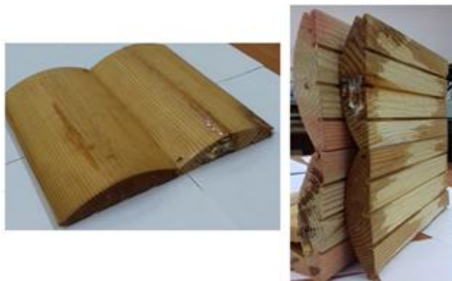
Fig. 2. “Blockhouse” samples

A wood building material, in addition to the available flat pine, aspen and larch samples [14–15], was used to imitate a pine bar (“Blockhouse”) for evaluating the effect of the geometry of wood samples on ignition, as well as the effect of flame retardants on fire hazard characteristics. The size of the samples in the experiment was (L × W × H): 0.25 × 0.02 × 0.11 m. Fig. 2 shows a photograph of the building material sample used for imitating a bar.